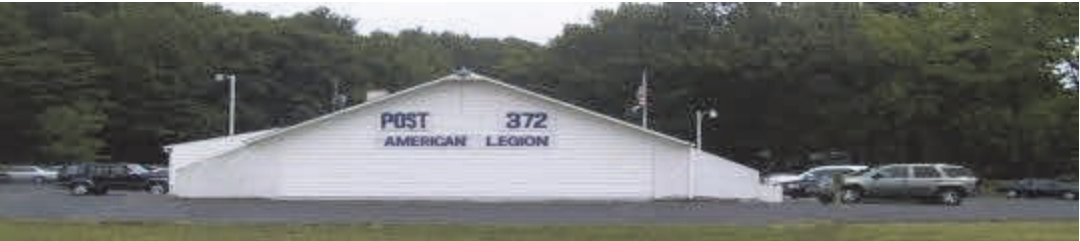
American Legion Post 372, 1532 Martin Ave., Cherry Hill, NJ 08002 856-665-3889